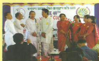
Teacher Trainees performing at Annual & Cultural Meet