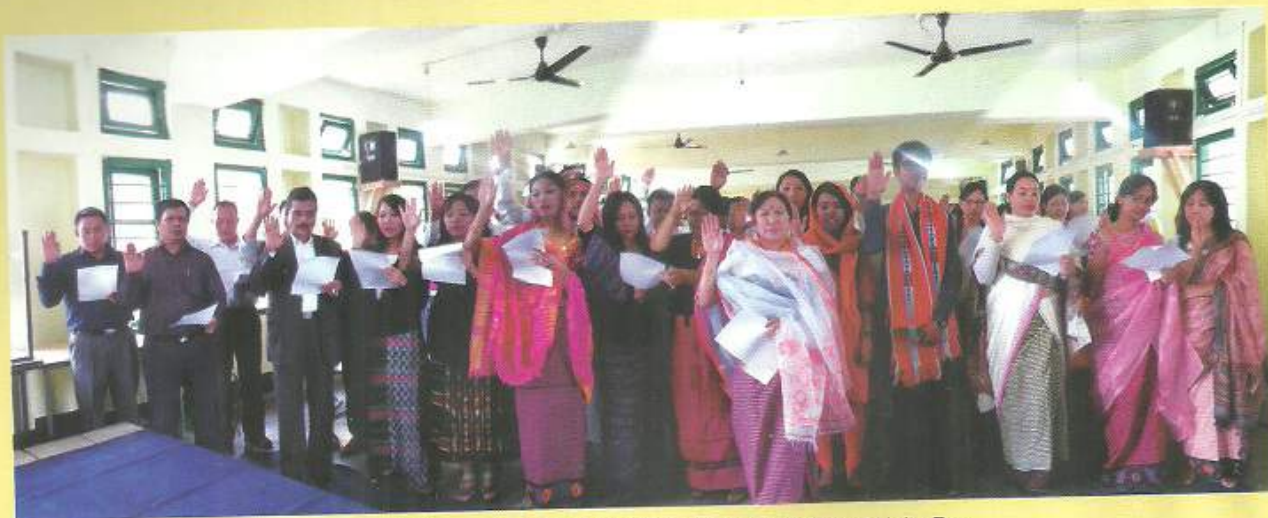
Teacher-Trainees pledging for National Unity on National Unity Day.