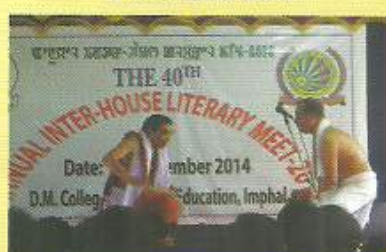
Annual Inter-house literary meet performing by Teacher Trainees.