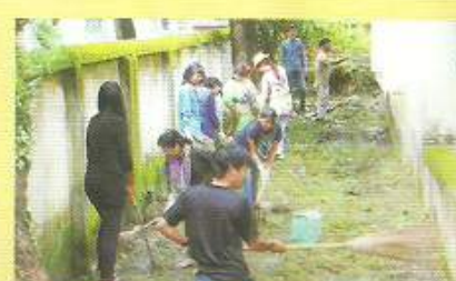
Inter-house social service competition