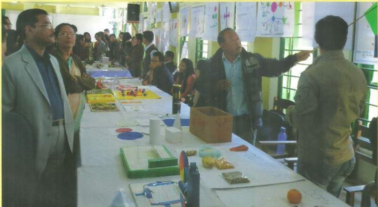
Instructional Media Exhibition.

Theory Classes of prescribed Syllabi of all subjects are transacted inside the class room, supported by teaching aids, materials and logistic doctrines. All the trainees have to undergo practice teaching in the allotted co-operating schools under the strict of supervisor appointed by the office of the principal. The exact programme for modality of curriculum transaction will be followed only after college is intimated by the Manipur University.