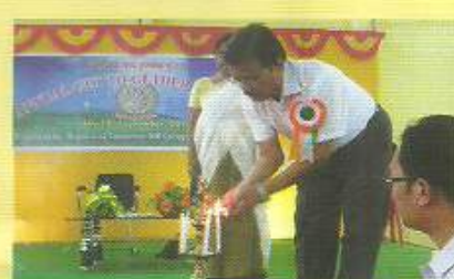
Principal DMCTE, enlighting on Annual get-together