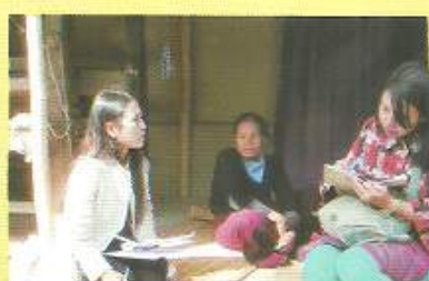
Community Contact Programme at Andro by Teacher trainees, DMCTE.