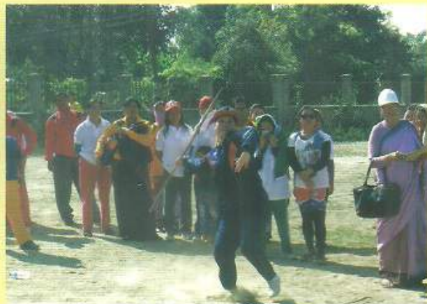
Teacher Trainees performing at Sport Meets.