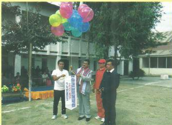
Opening ceremony Annual College Week, 2014-15 session.