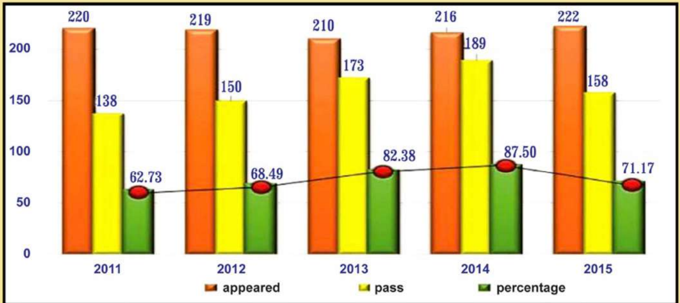
D.M. COLLEGE OF TEACHER EDUCATION, IMPHAL (MANIPUR), INDIA B.Ed. RESULT AT GLANCE (2011-2015)